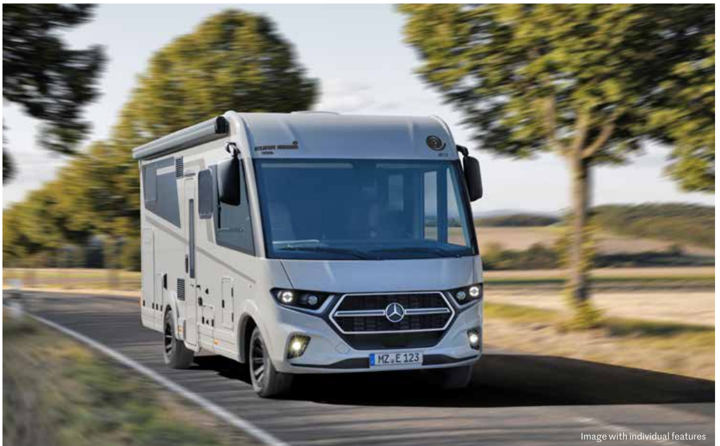
Image with individual features