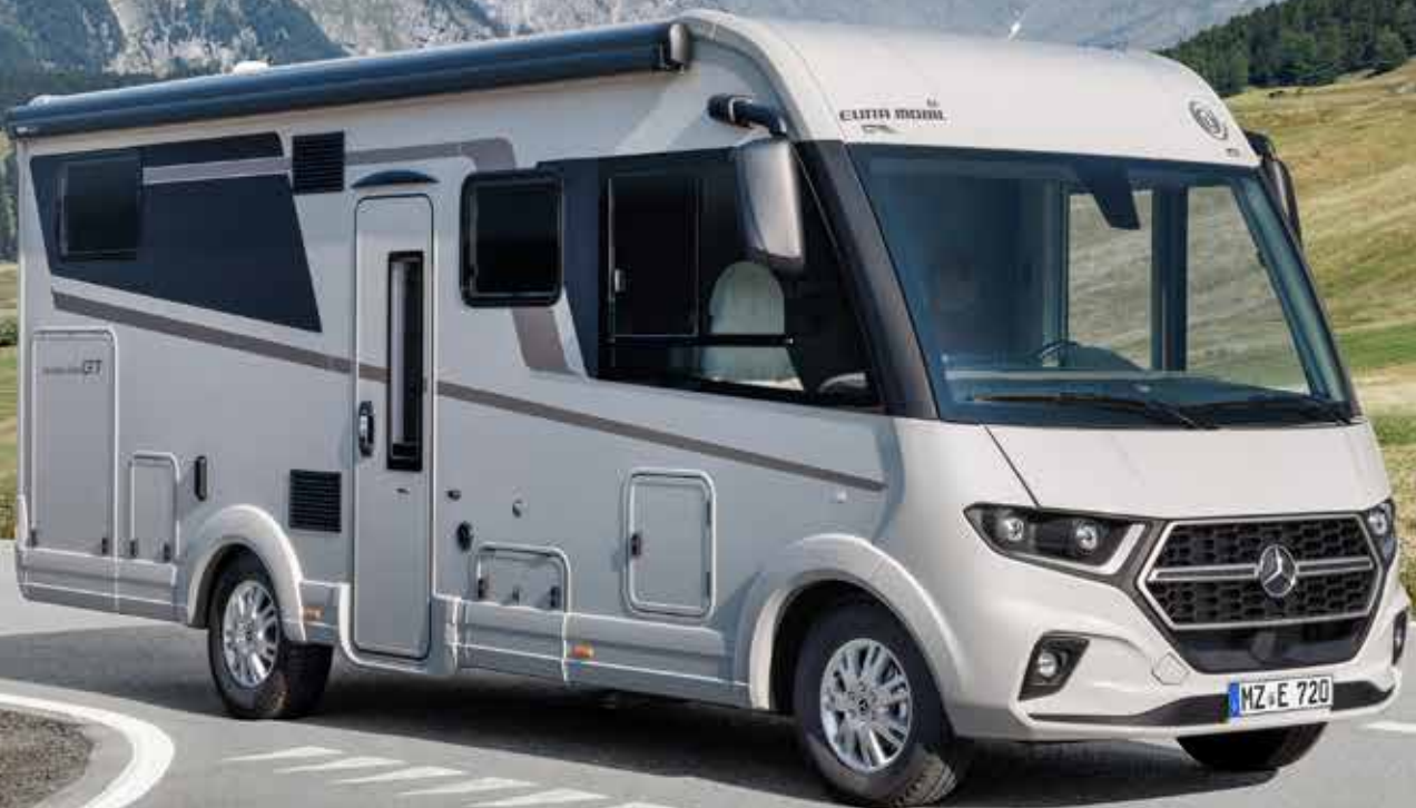
Illustration with customised equipment